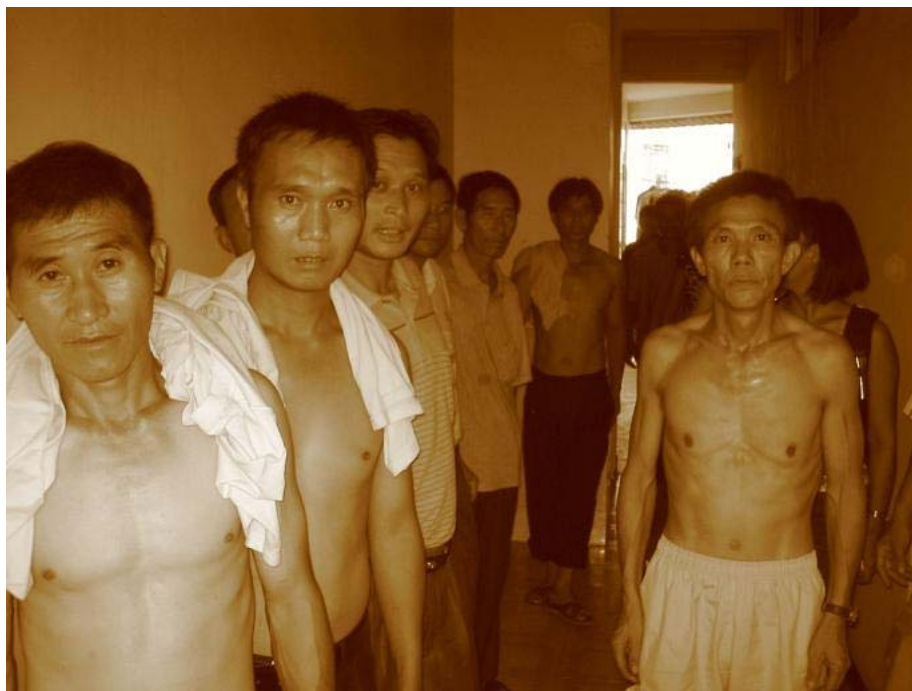
Some of the Leiyang workers gathered in their Shenzhen hotel, 31 July 2009

In May 2009, a group of nearly 180 workers from Leiyang traveled to Shenzhen to track down their previous employers and demand occupational illness compensation. They had all been employed as pile-blasting and drilling workers in Shenzhen in the 1990s, establishing the foundations for dozens of the city's skyscrapers and other building projects, including the subway. The long hours spent in dangerous, poorly ventilated construction sites with little or no protection from the clouds of rock dust meant that they all eventually contracted pneumoconiosis. At least 15 of their colleagues had already died of the disease before the group undertook the trip back to Shenzhen.